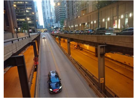
View of South Water Drive and Lower South Water Drive, showing the ramp from Columbus Drive to Lower Stetson Ave. The ramp from Lower Columbus Drive to Stetson Service Area is hidden behind it.

If you'd like to tip a bellman to bring your stuff to the Exhibit Hall, instead turn right on to Lower South Water St, avoiding the ramp, and then turn right onto Lower Stetson. The entrance for valet parking will be on your right. Valet parking is $39.50/day. For details see the Parking page .